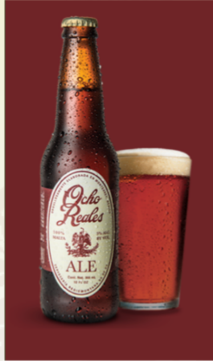
Ocho Reales Ale