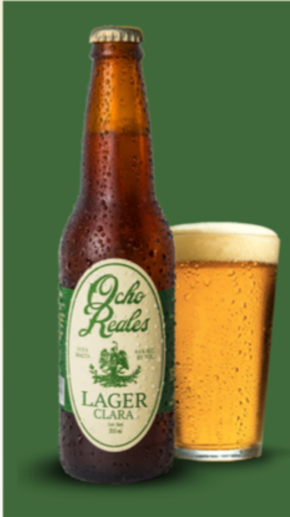
Ocho Reales Lager Clara