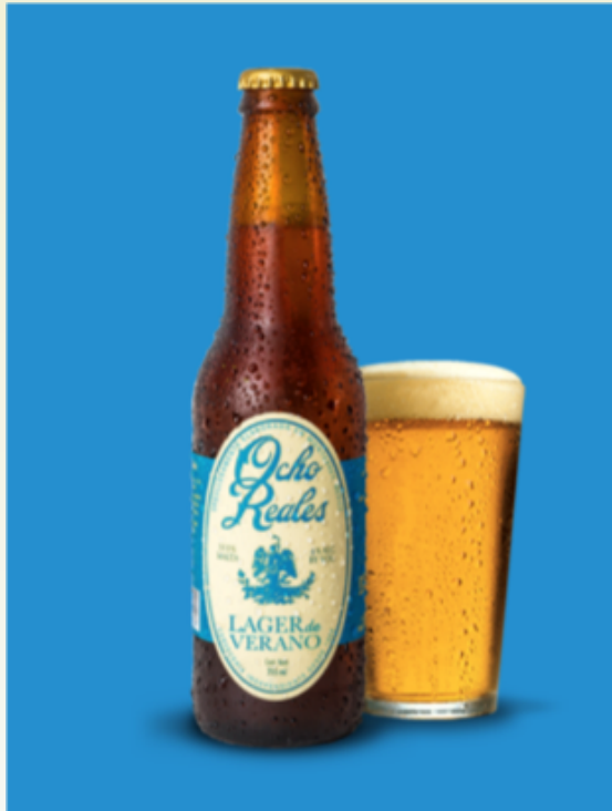
Ocho Reales Summer Lager