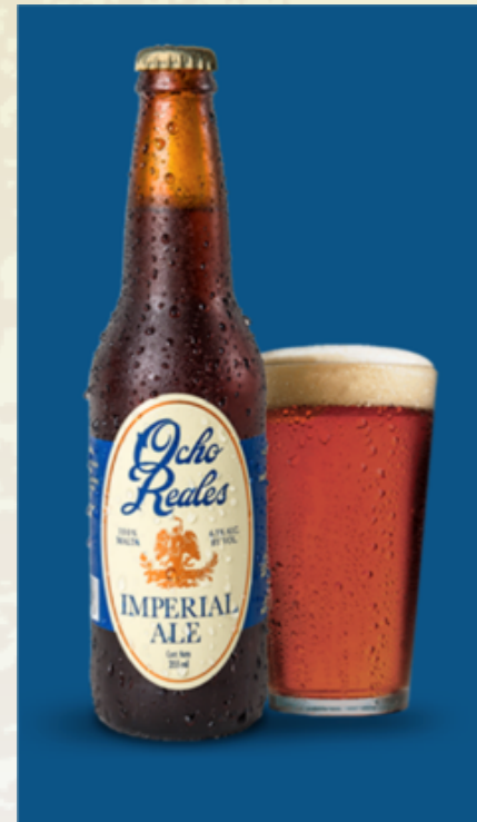
Ocho Reales Imperial Ale